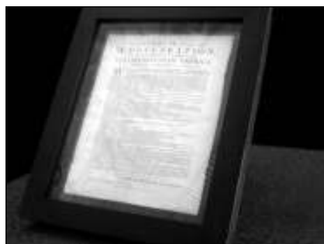
The copy of the Declaration of Independence at the Declare Yourself event.