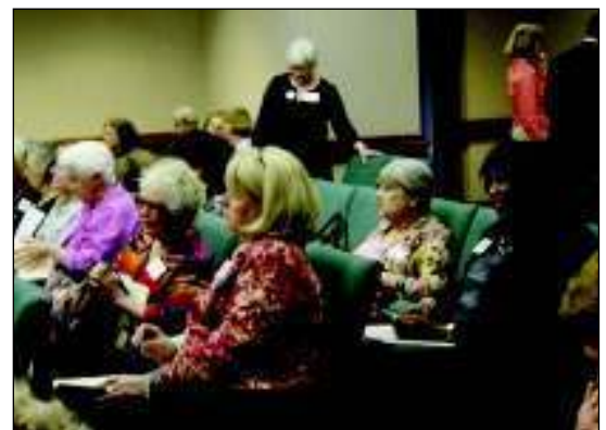
Top photo and above left and right — Houston Leaguers were well represented and in the audience at the Statewide Conference and Lobby Day in Austin.