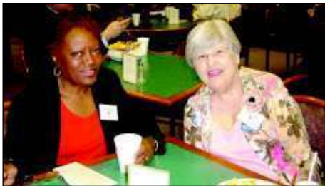
Houston Leaguers enjoy lunch and the opportunity to exchange notes about the morning's happenings.