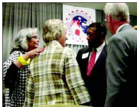
Three Houston mayoral candidates cross paths at Repast.