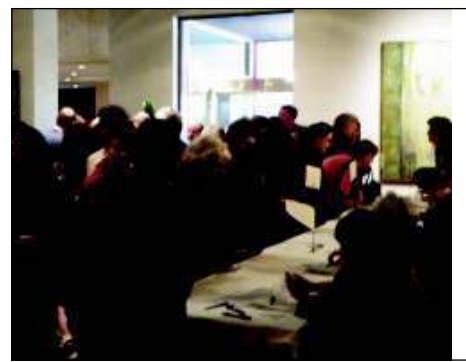
LWVH members get name tags and table assignments