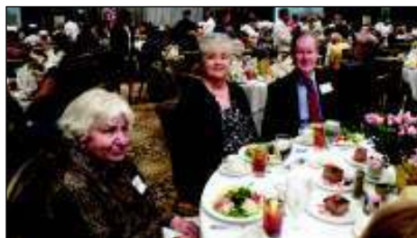
LWVH members enjoy the food and company.