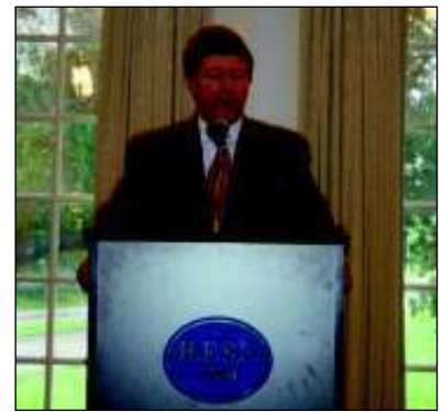
County Judge Ed Emmet